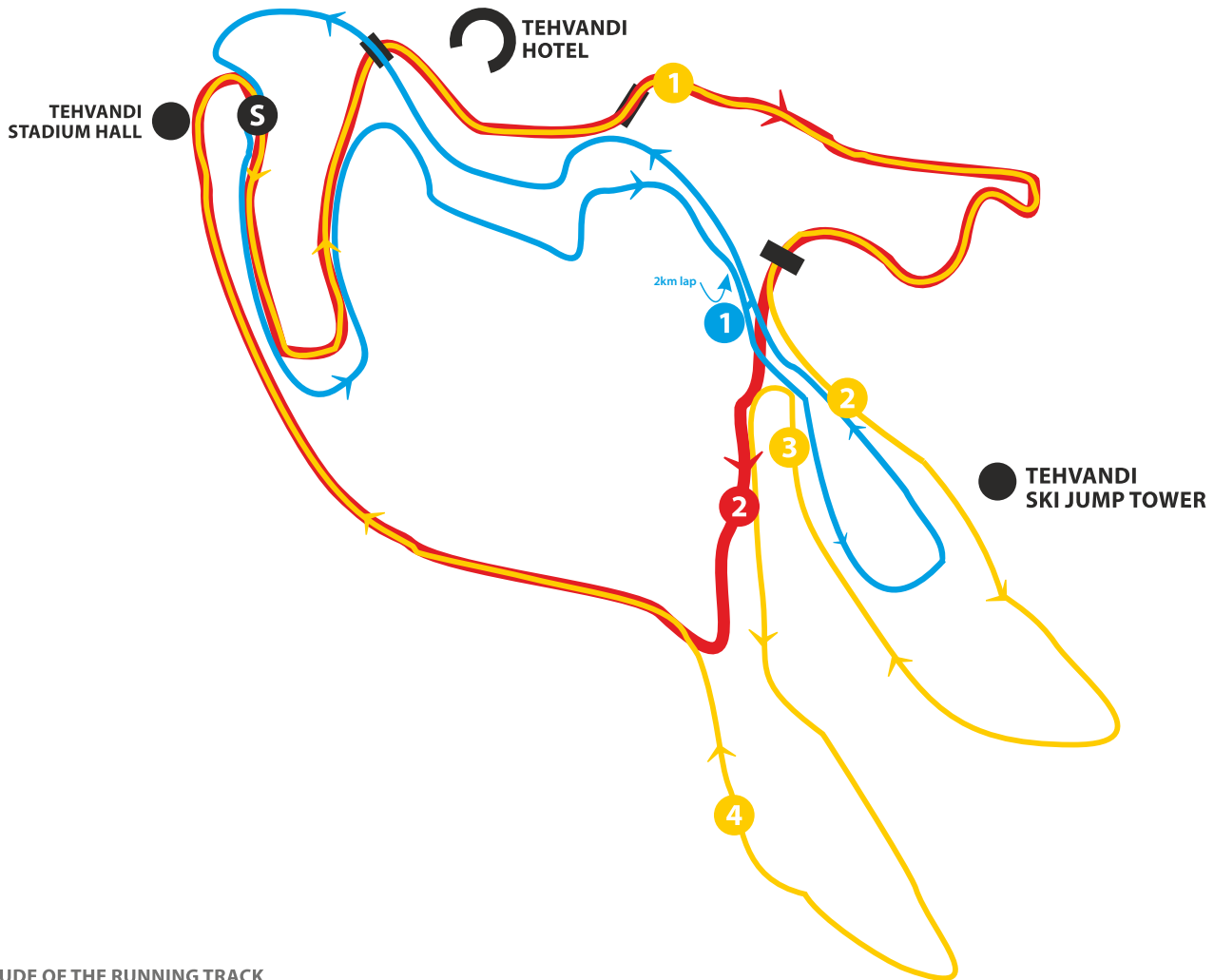
ALTITUDE OF THE RUNNING TRACK